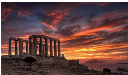
Sunset at Cape Sounion