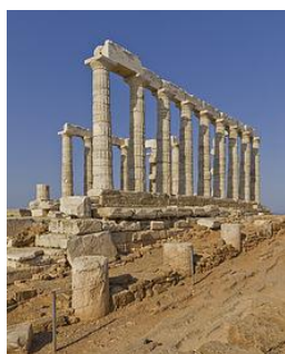
Temple of Poseidon at Cape Sounion

The site is a popular day-excursion for tourists from Athens, with the sunset over the Aegean Sea, as viewed from the ruins, a sought-after sight.